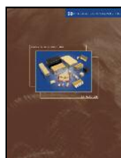
SMPS STACKED CAPACITORS