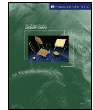
HIGH VOLTAGE & RADIAL LEADED PRODUCTS MIL-PRF-49467