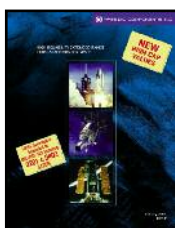
HIGH RELIABILITY EXTENDED RANGE CHIPS FOR SPACE