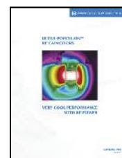
ULTRA-PORCELAIN RF CAPACITORS