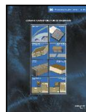
CERAMIC CAPACITORS FOR RF, MICROWAVE & FIBER OPTIC APPLICATIONS