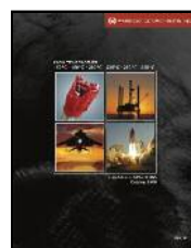
HIGH TEMPERATURE CERAMIC CAPACITORS